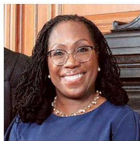
Ketanji Brown Jackson

Justice Jackson spoke only to say her oaths during Thursday's brief ceremony.